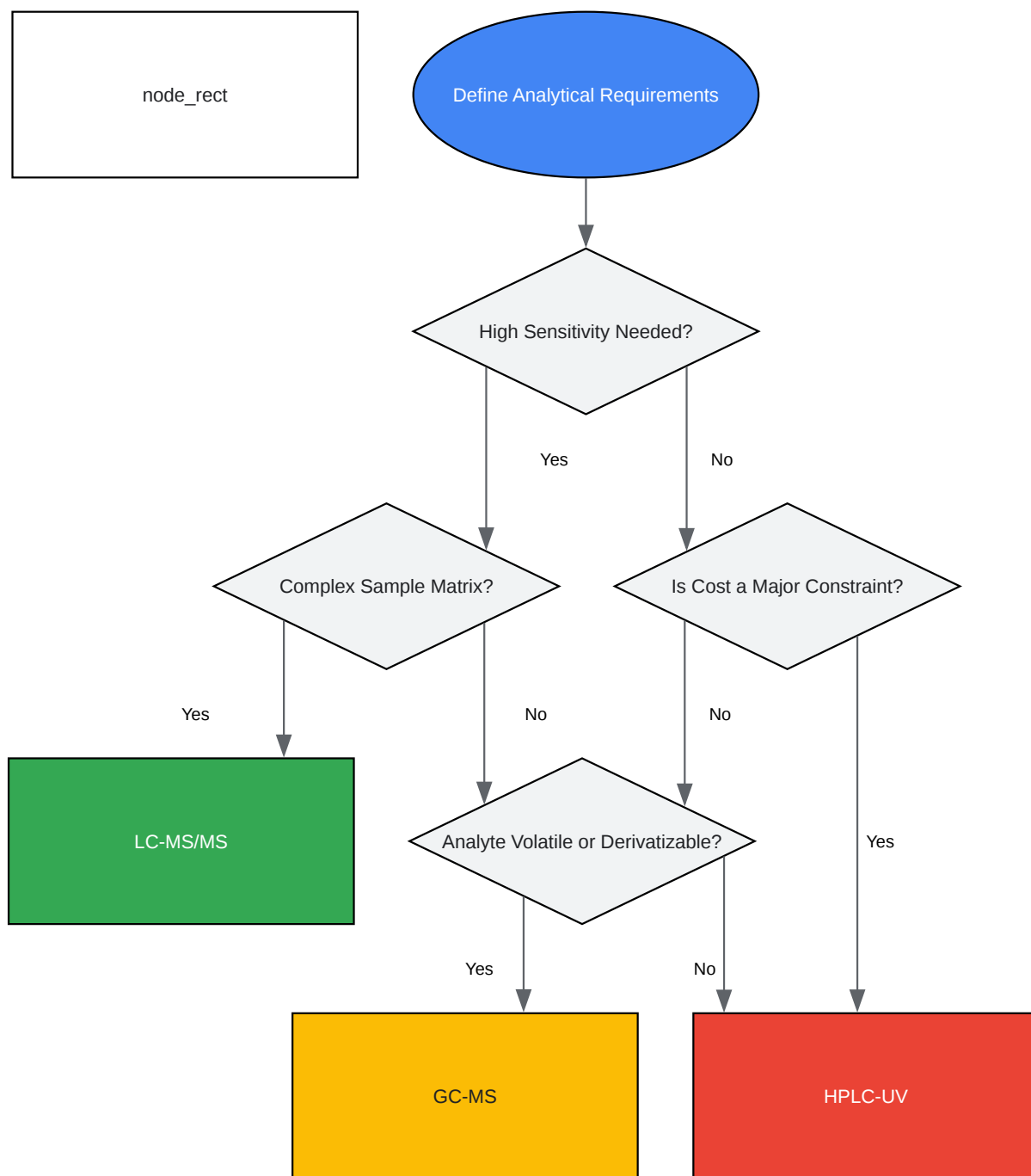
Decision Workflow for Method Selection

Click to download full resolution via product page