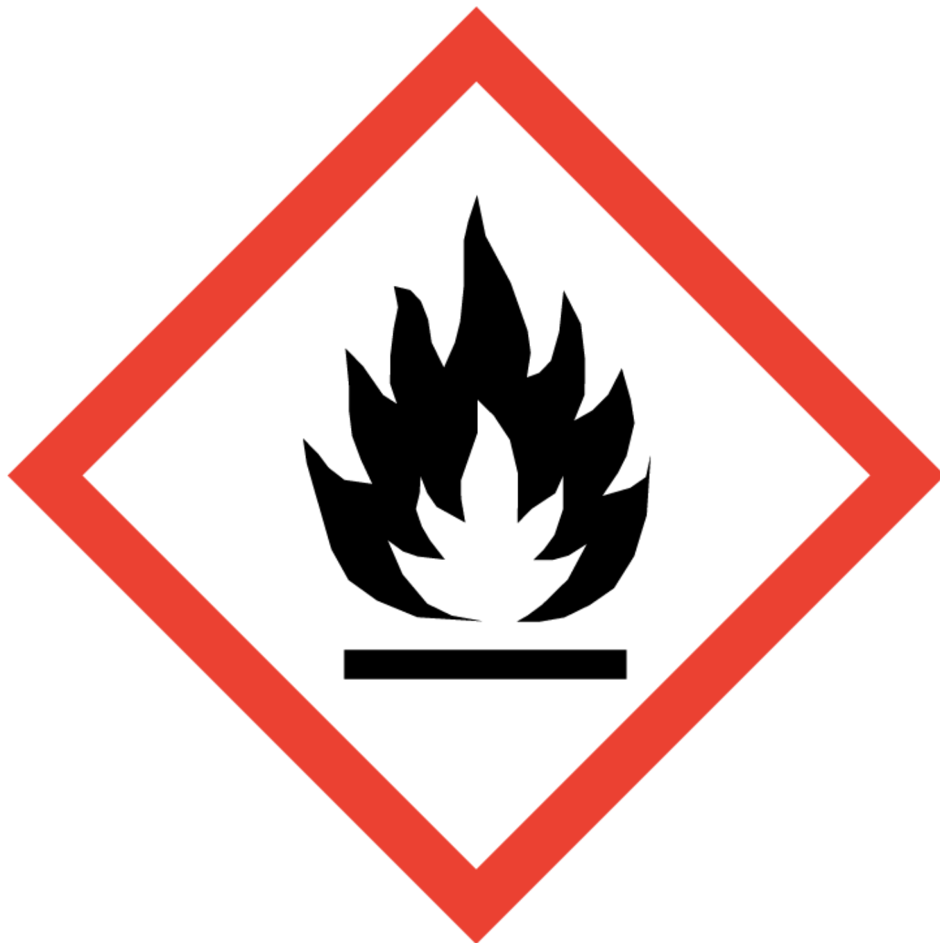
Table 1: GHS Hazard Classification for Piperazine Analogues[4][5][9] | Hazard Class | GHS Pictogram | Signal Word | Hazard Statement | | :--- | :---: | :---: | :--- | | Flammable Solids |

| Danger | H228: Flammable solid. | | Skin Corrosion/Irritation |