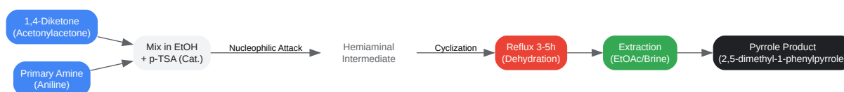
Diagram 2: Paal-Knorr Synthetic Workflow[7][8]

Click to download full resolution via product page