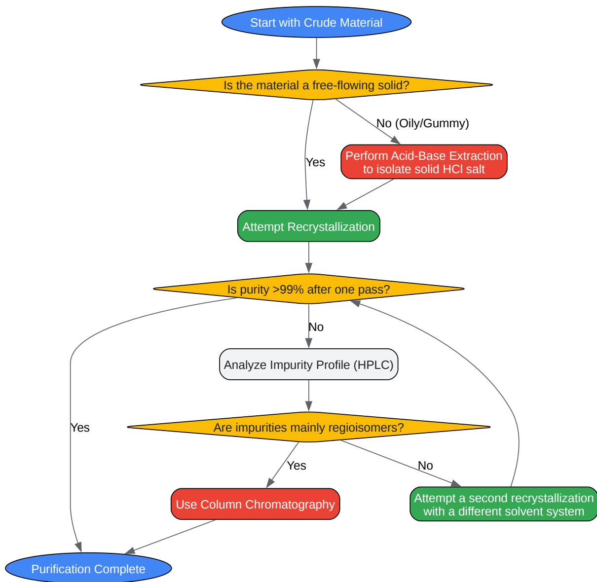
Diagram 2: Decision Tree for Method Selection

Click to download full resolution via product page