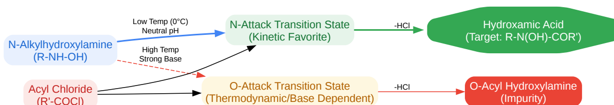
Figure 1: Mechanistic Pathway of Regioselective Acylation