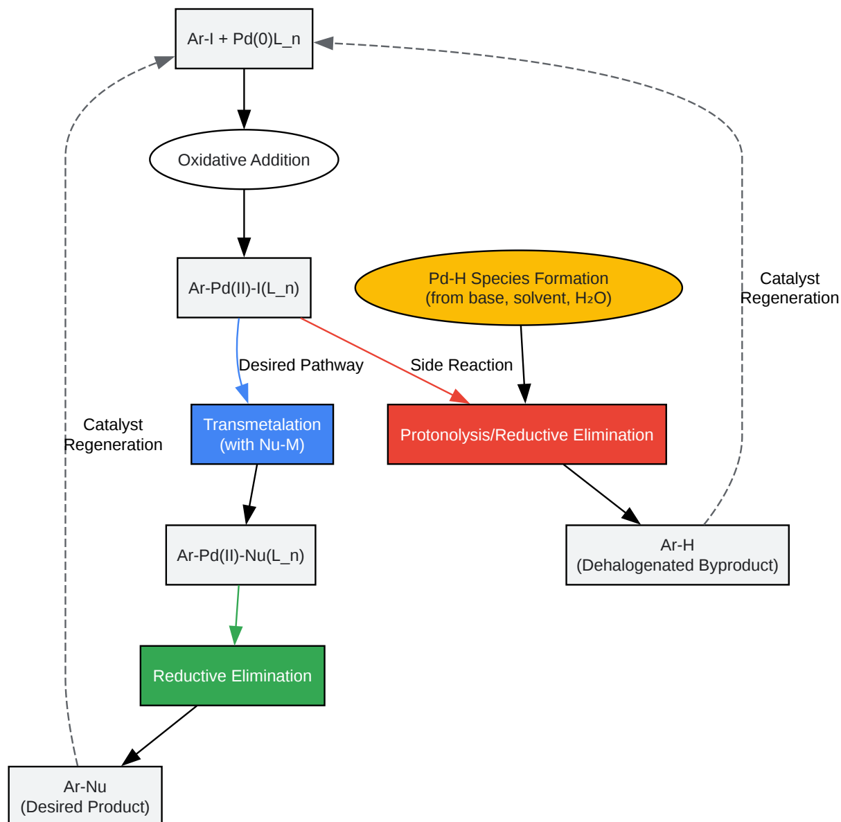
Figure 1: Competing Pathways in Pd-Catalyzed Cross-Coupling

Click to download full resolution via product page