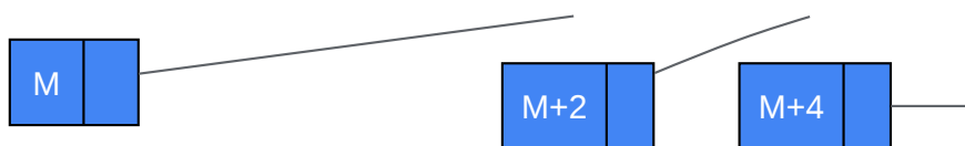
Mass Spectrum of a Dichlorinated Fragment

Click to download full resolution via product page