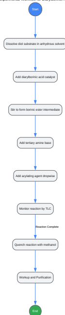
General Experimental Workflow for Diarylborinic Acid Catalysis

Click to download full resolution via product page