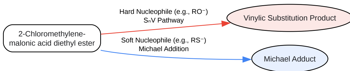
Diagram of Competing Pathways

Click to download full resolution via product page