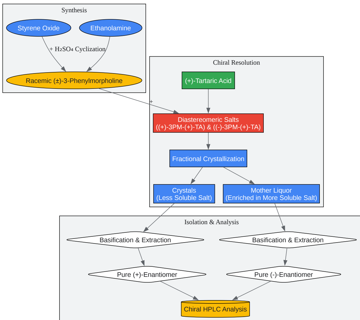
Experimental Workflow for 3-Phenylmorpholine Enantiomer Resolution

Click to download full resolution via product page