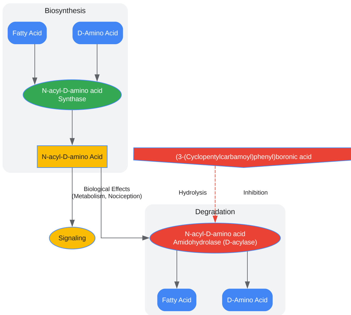
Metabolic Pathway of N-acyl-D-amino Acids

Click to download full resolution via product page