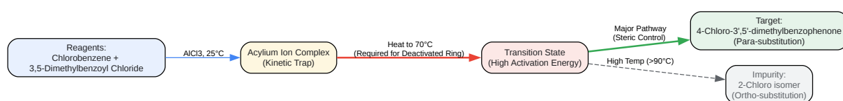
Fig 1: Thermal Activation Pathway for Deactivated Substrate Acylation

Click to download full resolution via product page