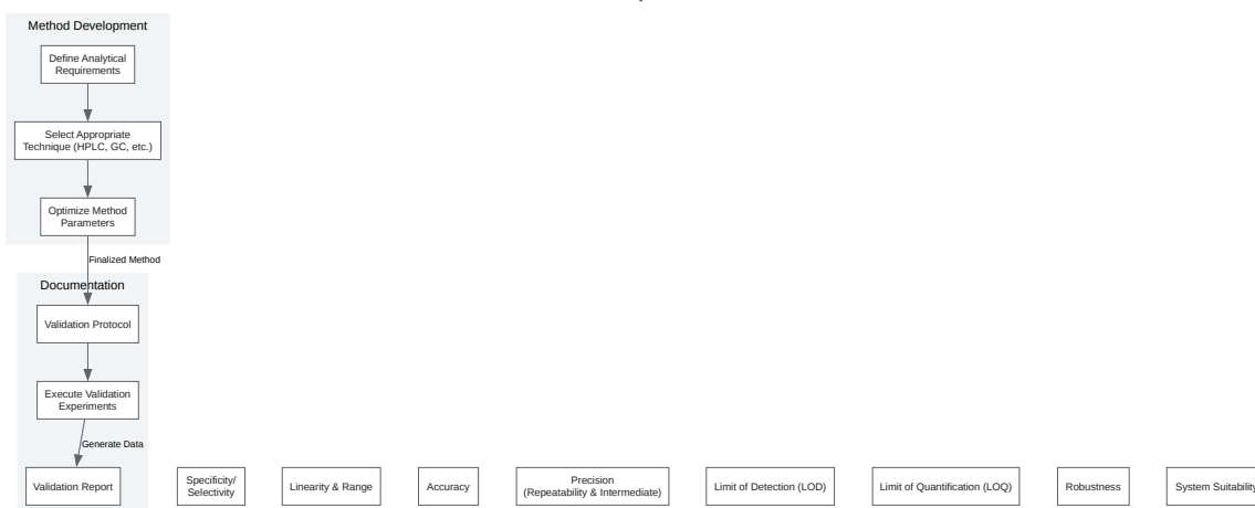
General Workflow for Analytical Method Validation