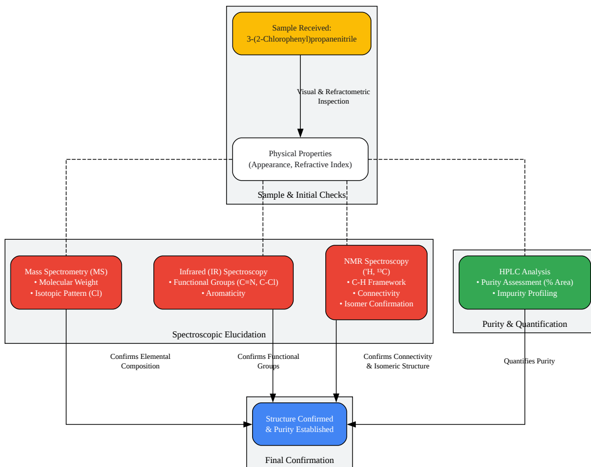
Fig. 1: Integrated Analytical Workflow

Click to download full resolution via product page