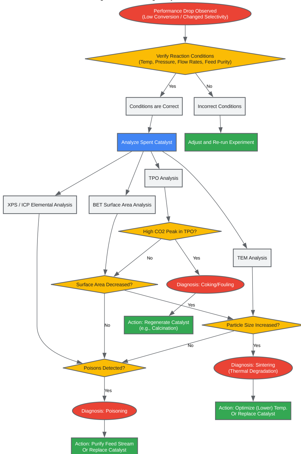
Fig. 1: Troubleshooting Catalyst Deactivation

Click to download full resolution via product page