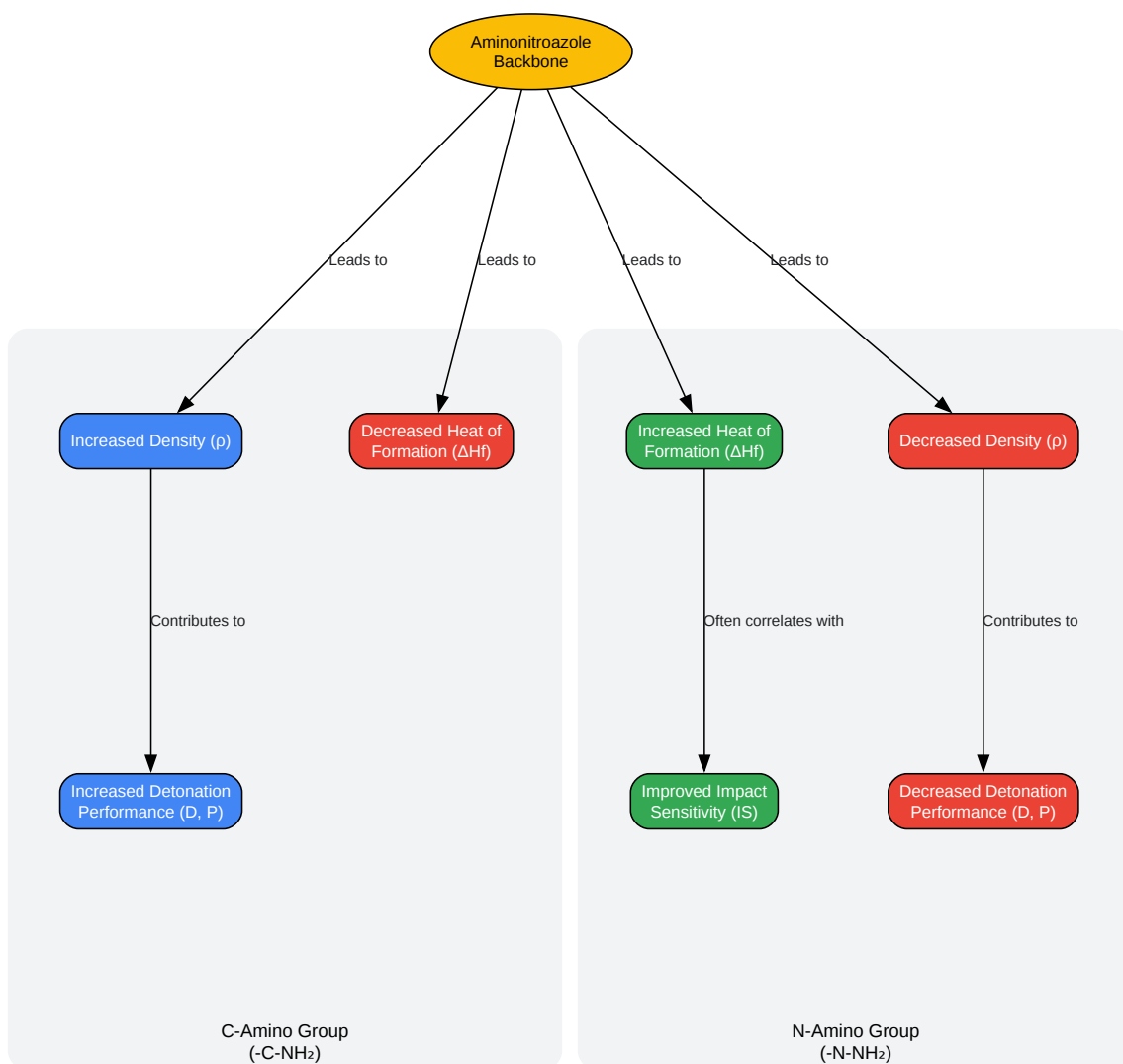
Fig 2. Influence of Amino Group Position on Properties