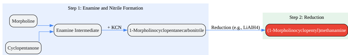
Diagram 1: Synthesis of (1-Morpholinocyclopentyl)methanamine

Click to download full resolution via product page