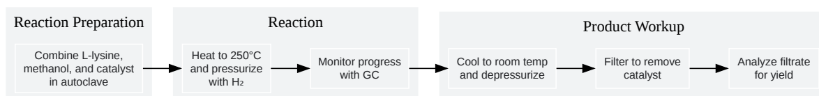
Diagram of the Experimental Workflow:

Click to download full resolution via product page