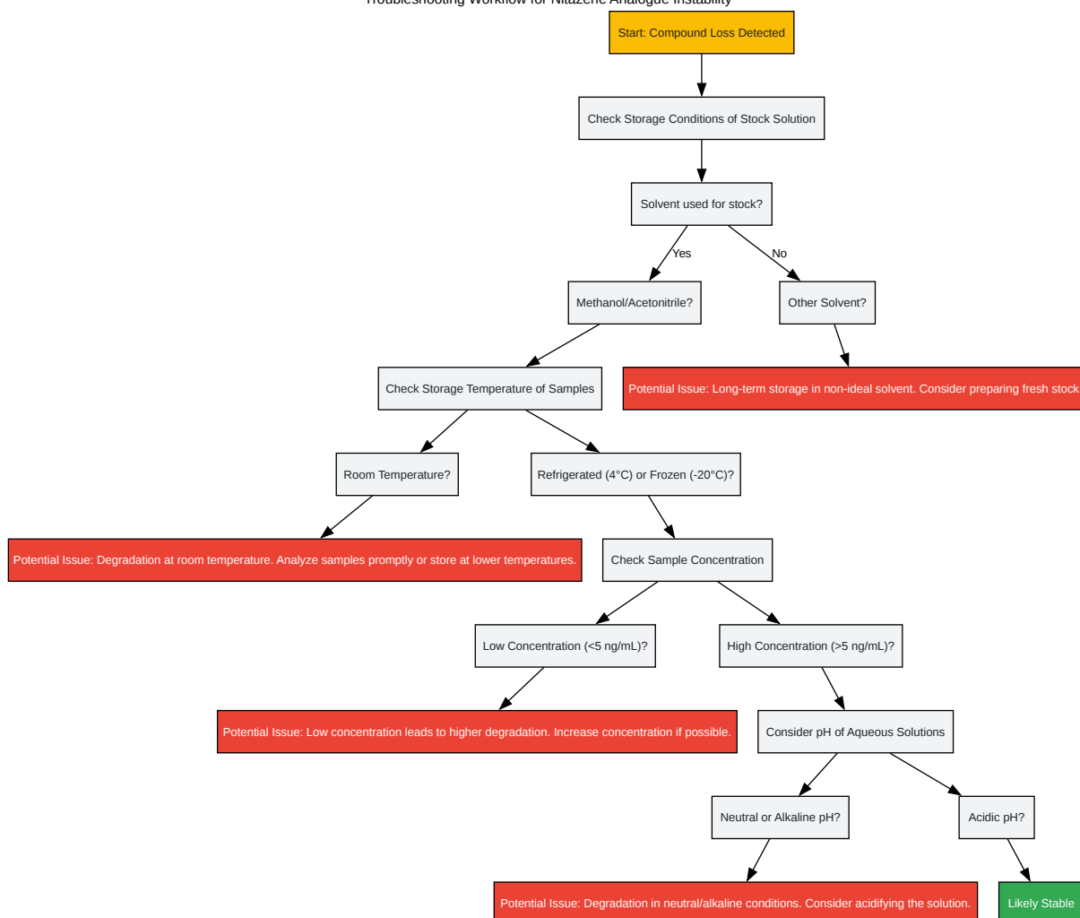
Troubleshooting Workflow for Nitazene Analogue Instability

Click to download full resolution via product page