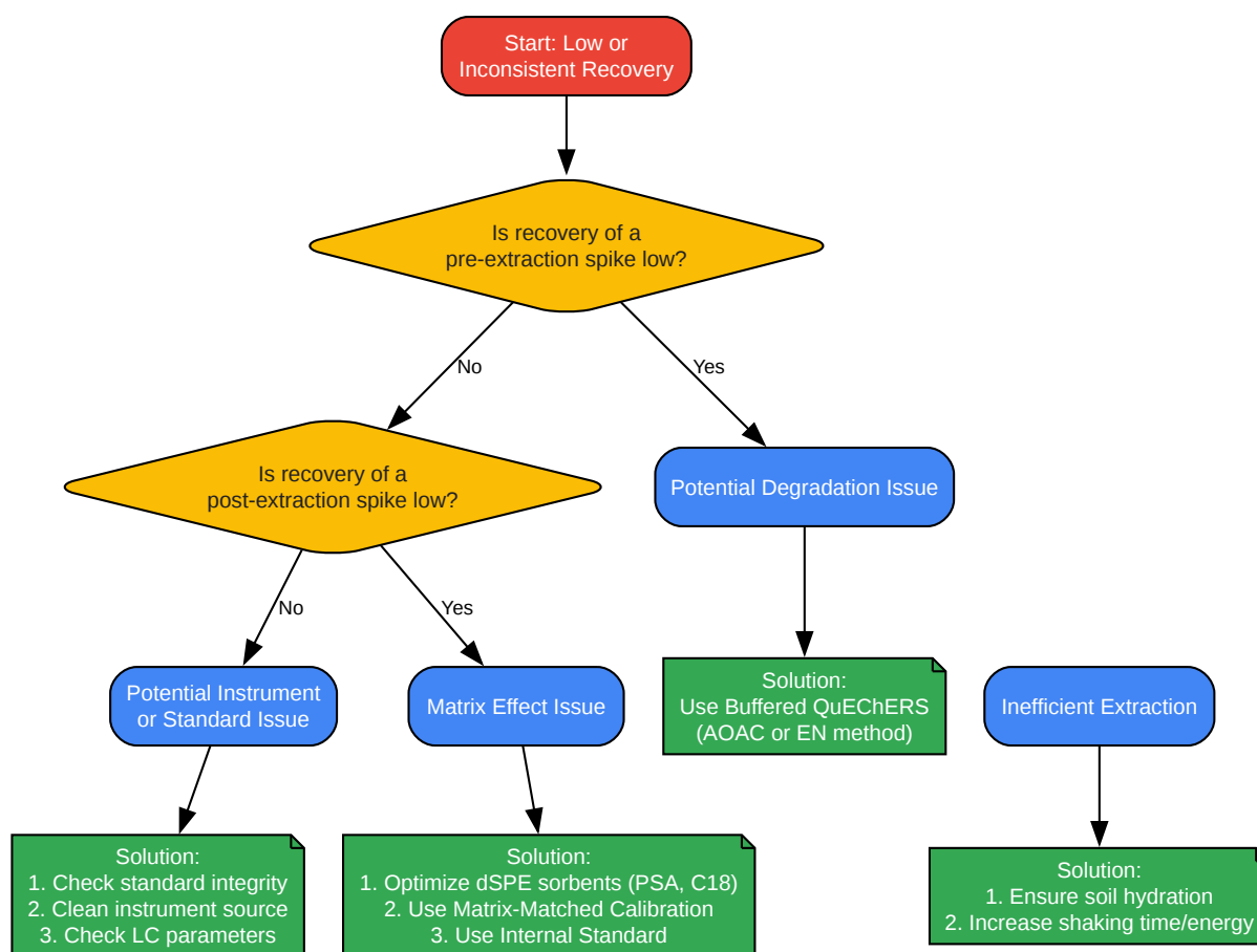
Caption: Standard QuEChERS workflow for metolcarb analysis in soil.

Click to download full resolution via product page