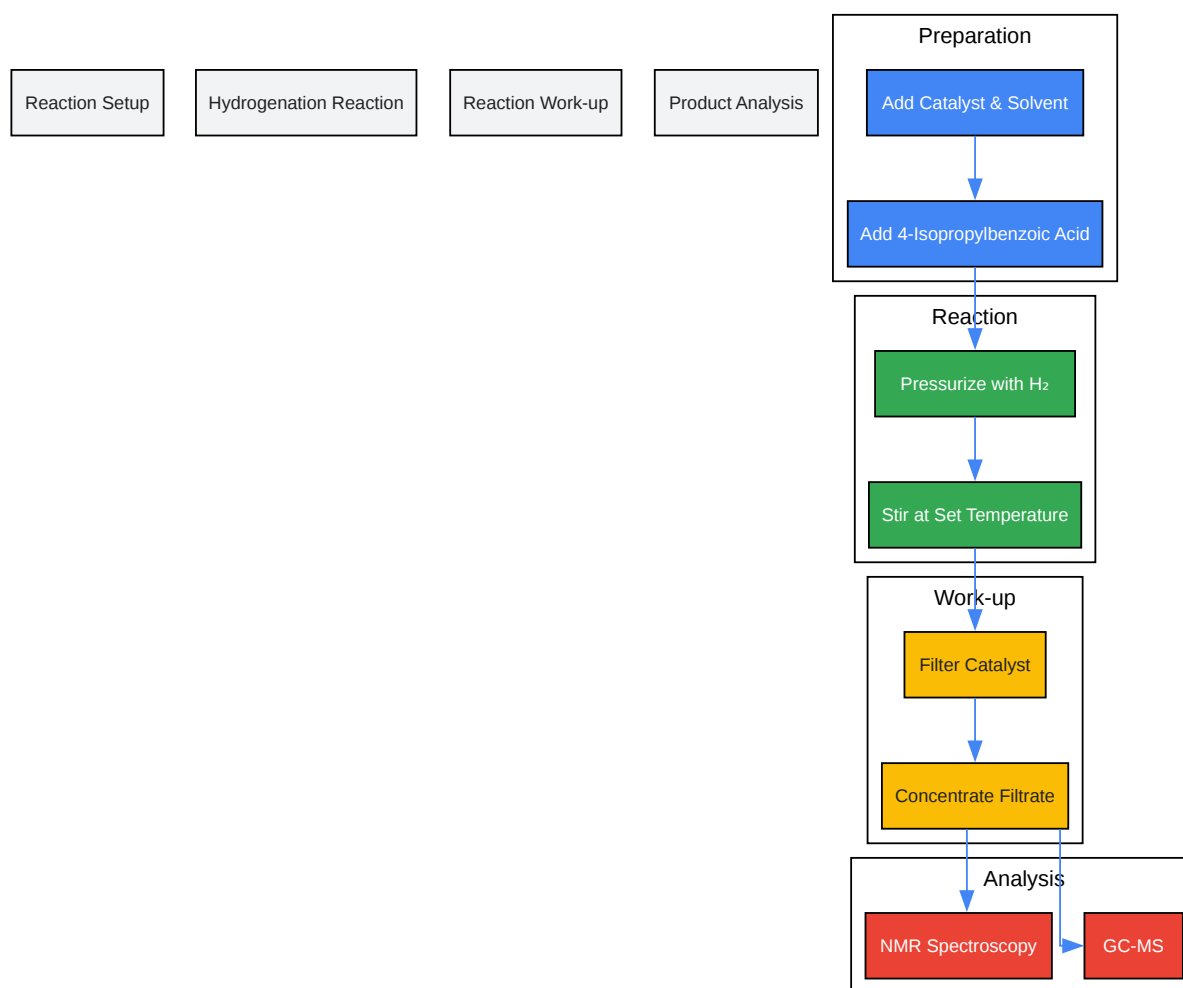
Experimental Workflow for Hydrogenation

Click to download full resolution via product page