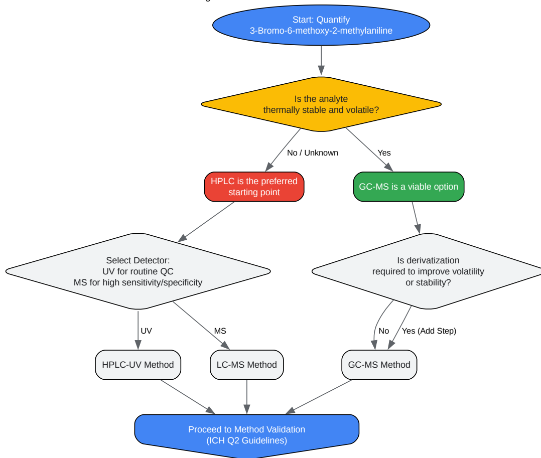
Diagram 1: Method Selection Workflow

Click to download full resolution via product page