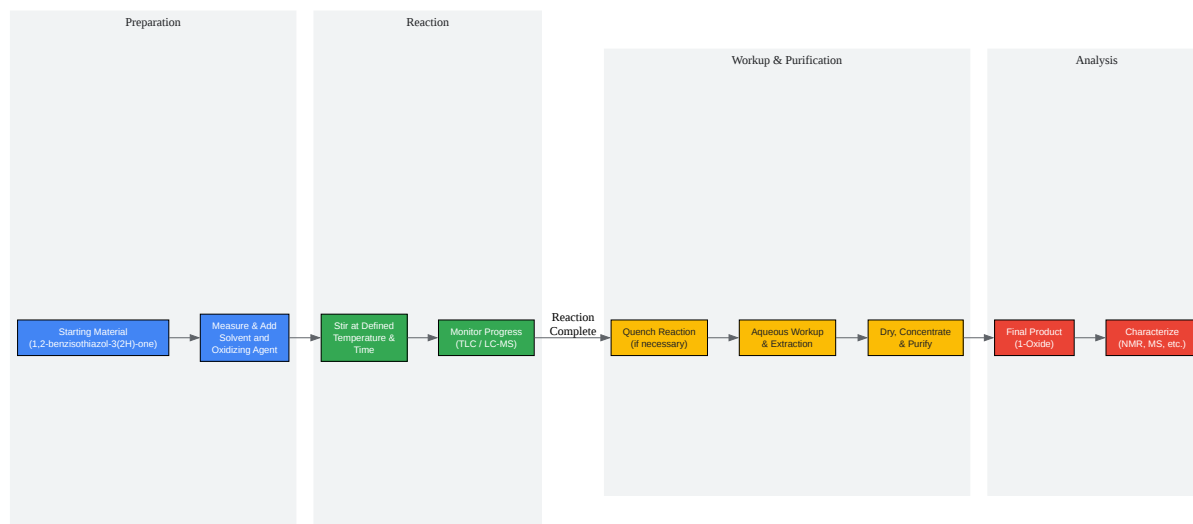
General Workflow for 1-Oxide Synthesis

Click to download full resolution via product page