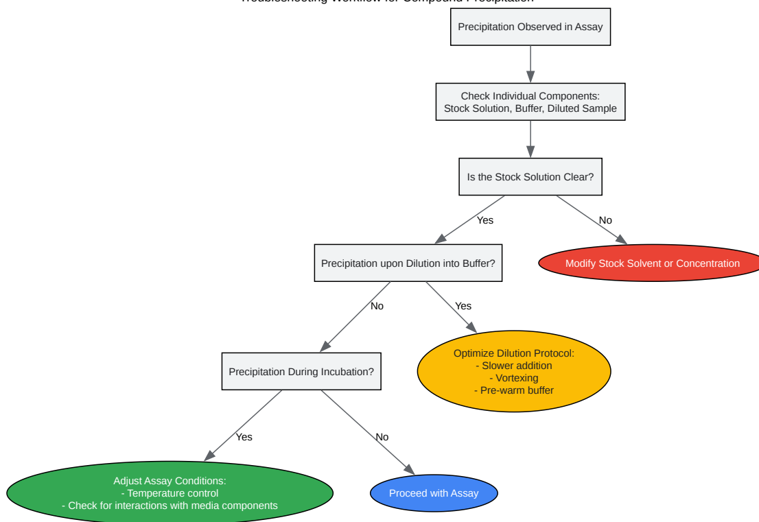
Troubleshooting Workflow for Compound Precipitation