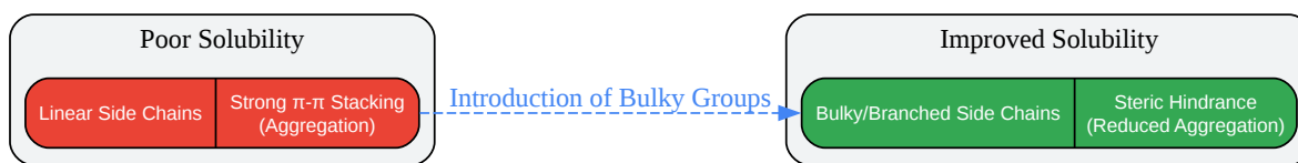
Diagram: Impact of Side Chains on Polyfluorene Solubility

Click to download full resolution via product page