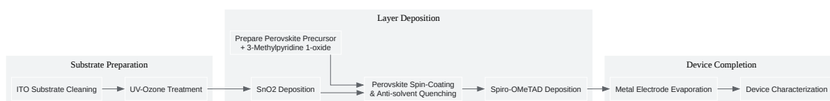
Diagram: Workflow for Perovskite Solar Cell Fabrication with Additive

Click to download full resolution via product page