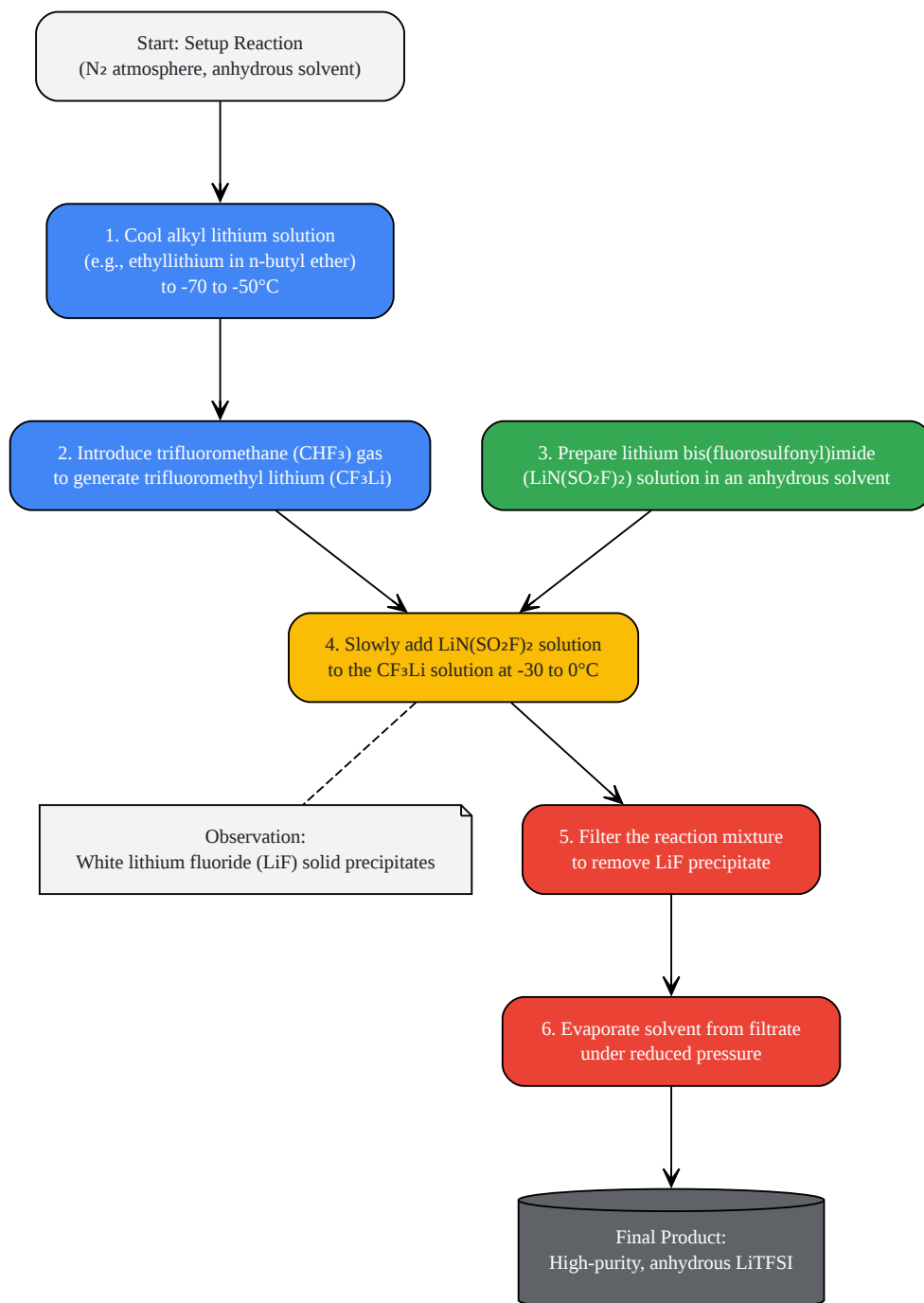
Workflow for Anhydrous One-Pot LiTFSI Synthesis

This protocol, adapted from patent literature, describes an anhydrous method for producing high-purity LiTFSI, suitable for applications like batteries.[6] It involves the in-situ generation of trifluoromethyl lithium.