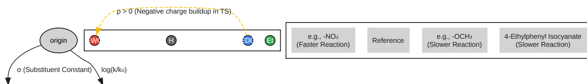
Figure 2: Conceptual Hammett Plot for Isocyanate Reactions

Click to download full resolution via product page