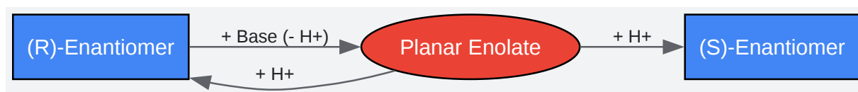
Diagram 1: Racemization Mechanism

Click to download full resolution via product page