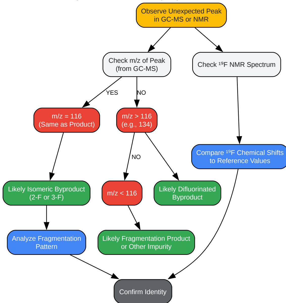
Diagram 1: Workflow for Impurity Identification

Click to download full resolution via product page