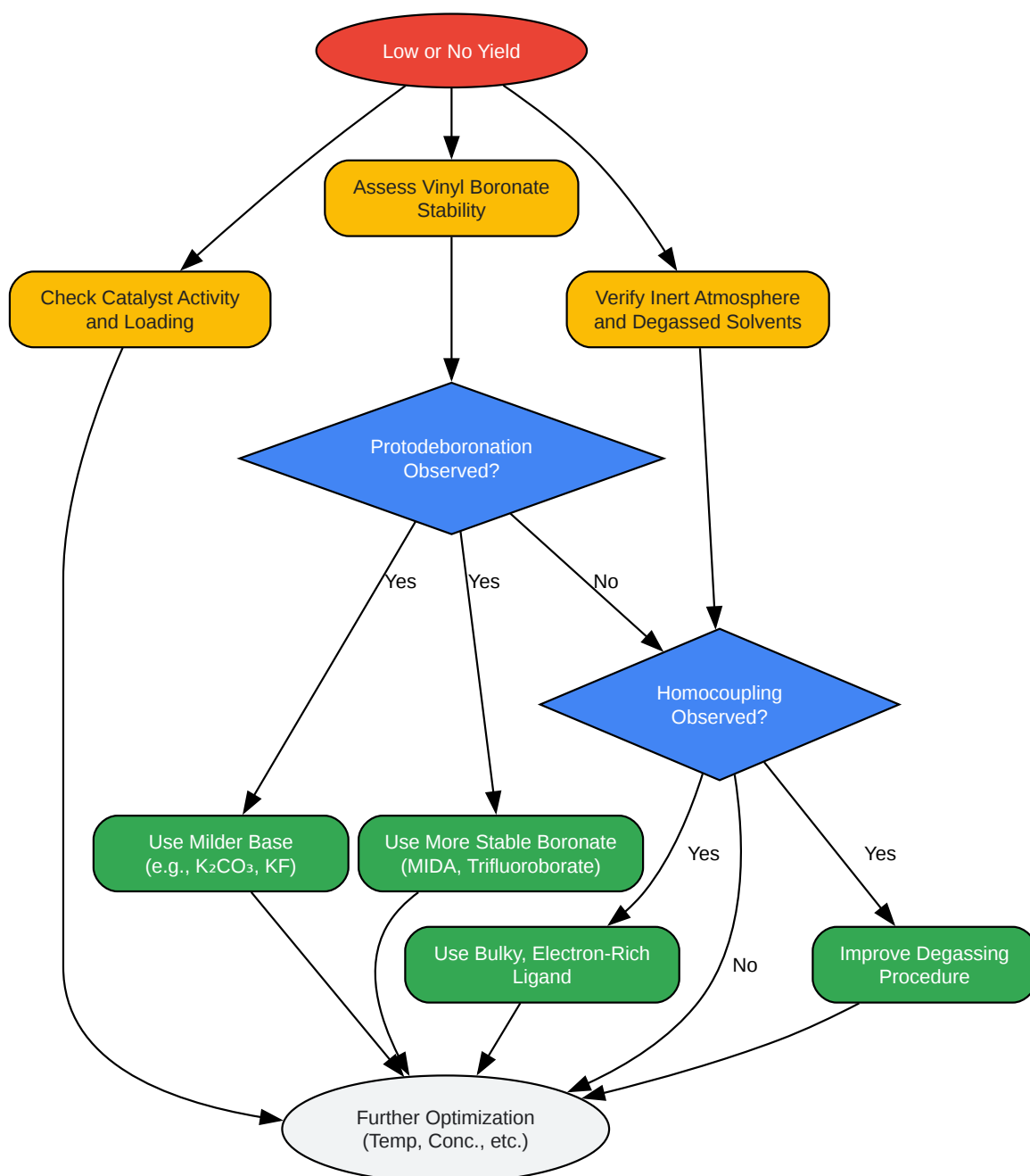
Figure 2: Troubleshooting Workflow for Low Yield

Click to download full resolution via product page