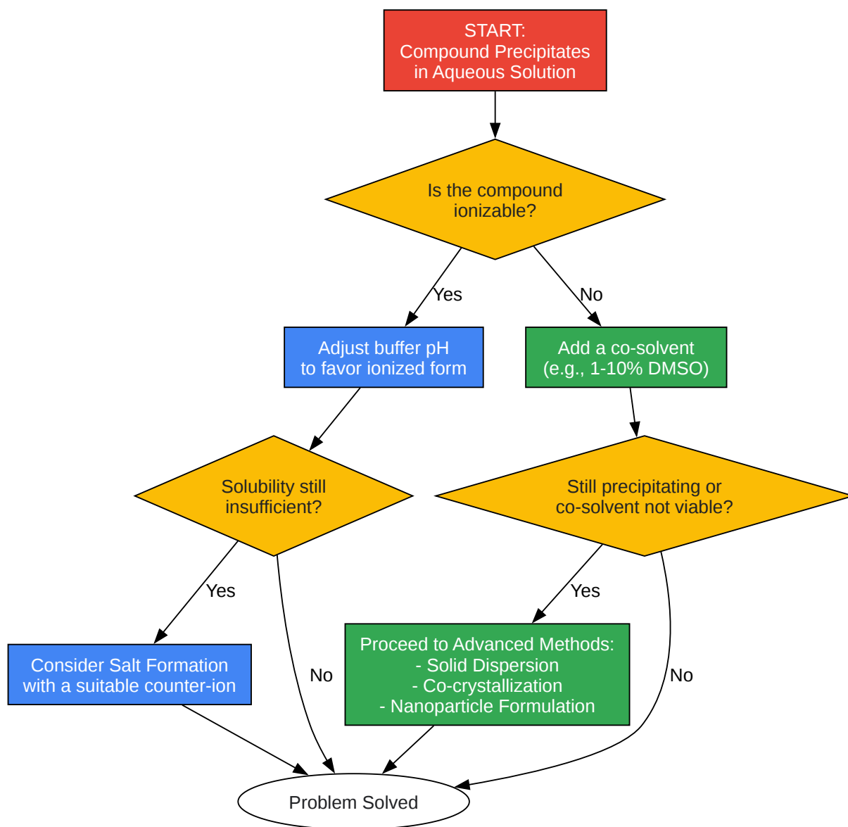
Diagram 2: Troubleshooting Flowchart for Solubility Issues

Click to download full resolution via product page