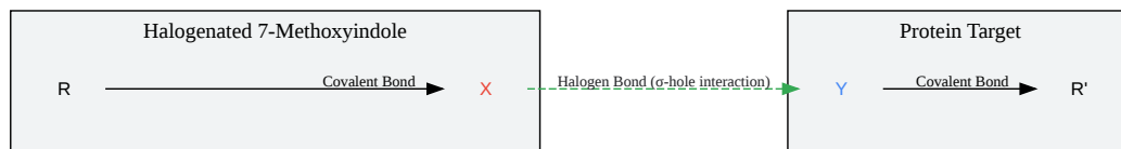
Fig 1. The Halogen Bond Interaction. X = Cl, Br, I; Y = O, N, S.