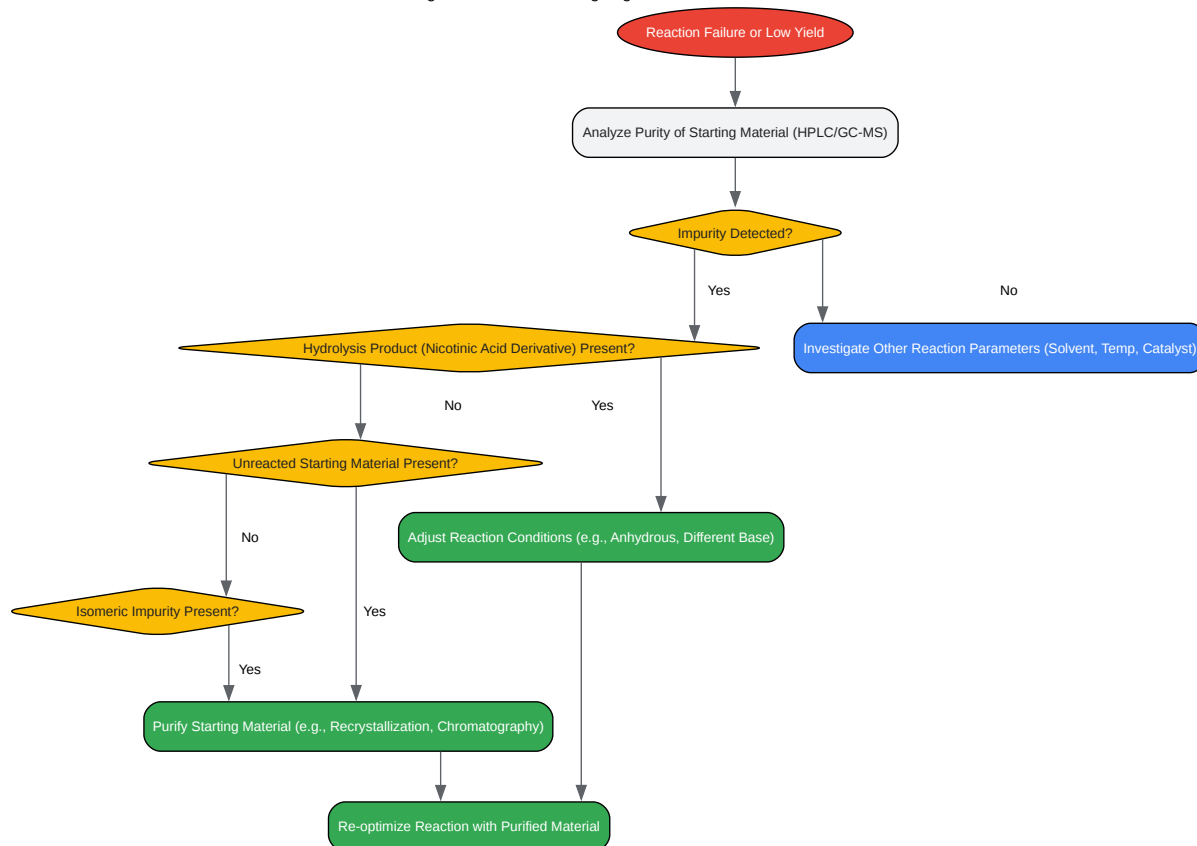
Figure 2. Troubleshooting Logic for Failed Reactions

Click to download full resolution via product page