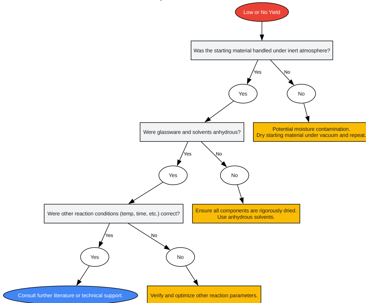
Troubleshooting Workflow for Low Reaction Yield

Click to download full resolution via product page