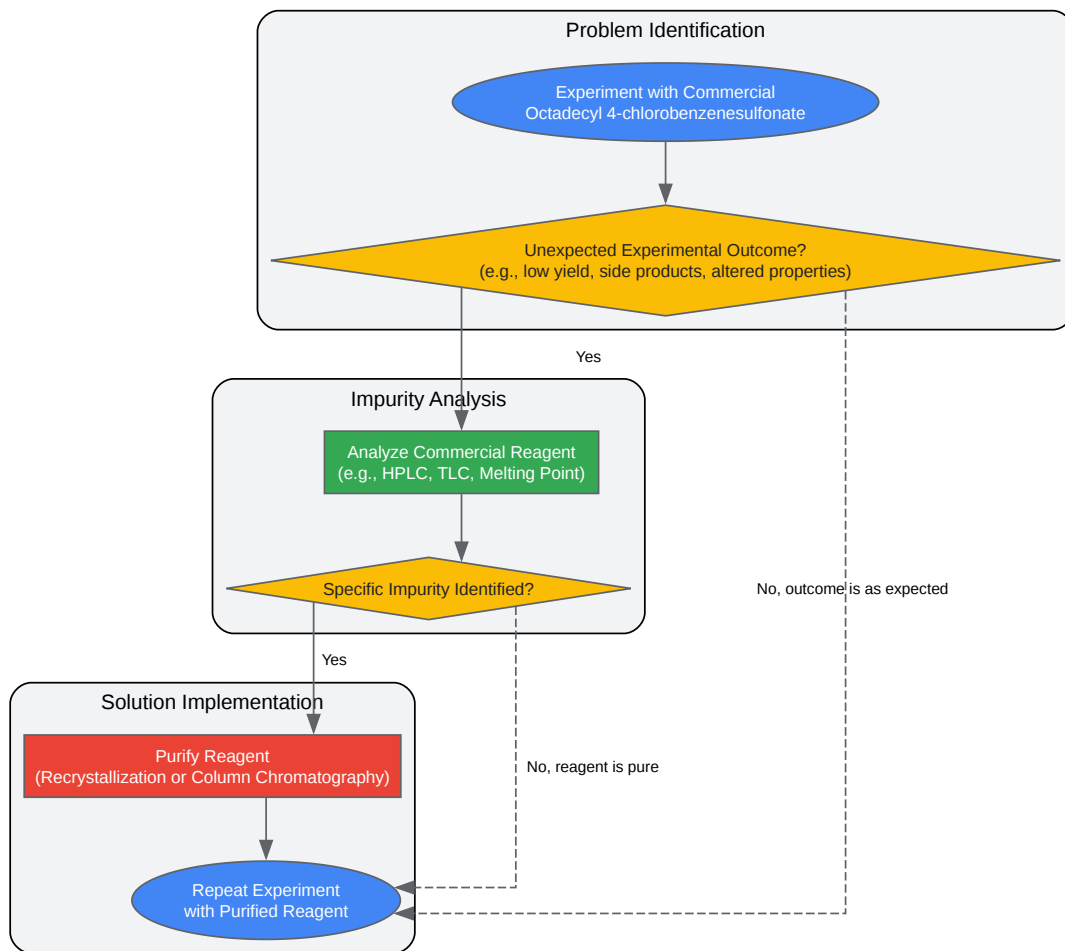
Troubleshooting Workflow for Impure Octadecyl 4-chlorobenzenesulfonate

Click to download full resolution via product page