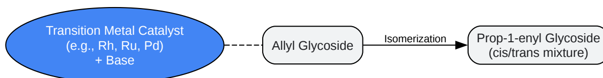
Diagram 1: Allyl Glycoside Isomerization

To further clarify the key transformations and troubleshooting logic, the following diagrams are provided.