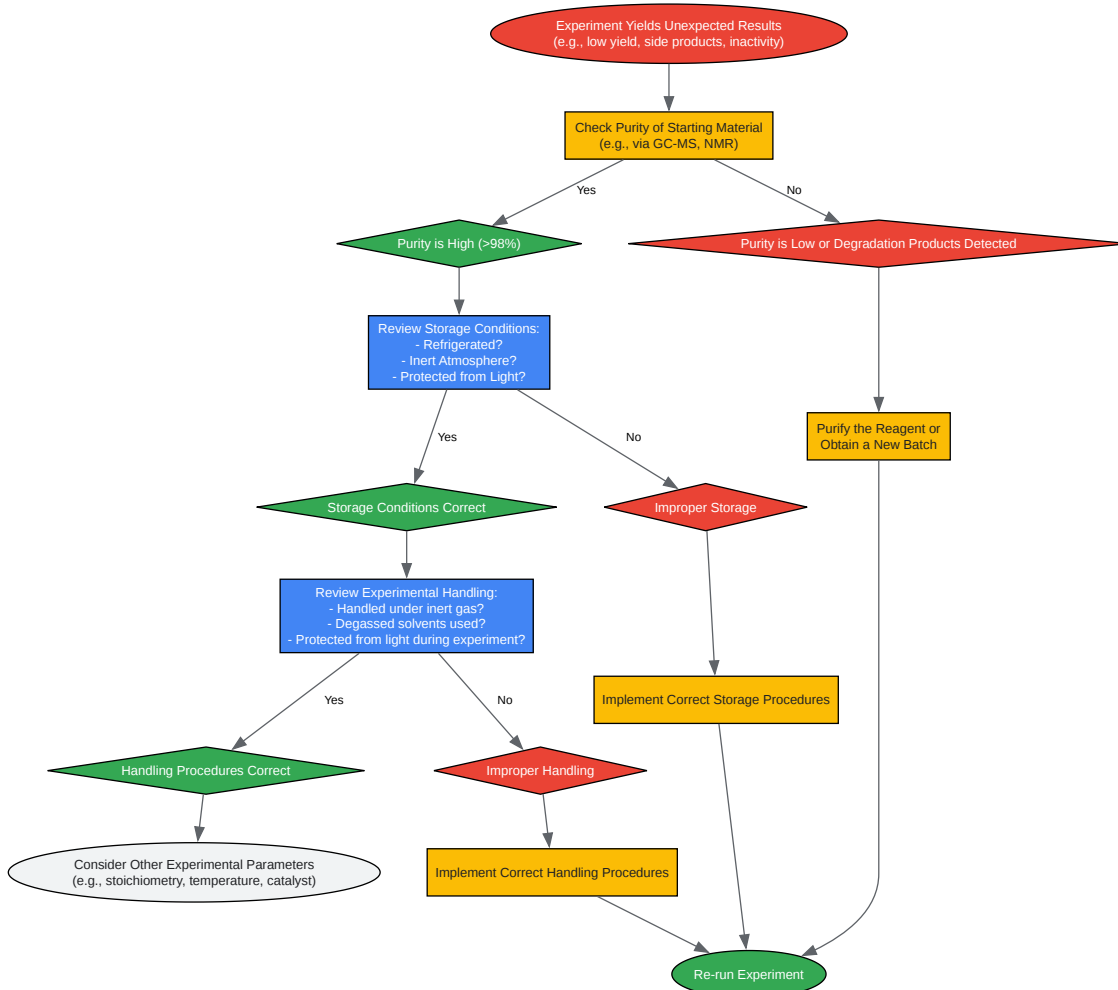
Troubleshooting Flow for Stability Issues of 3-Acetyl-2,5-dimethylthiophene