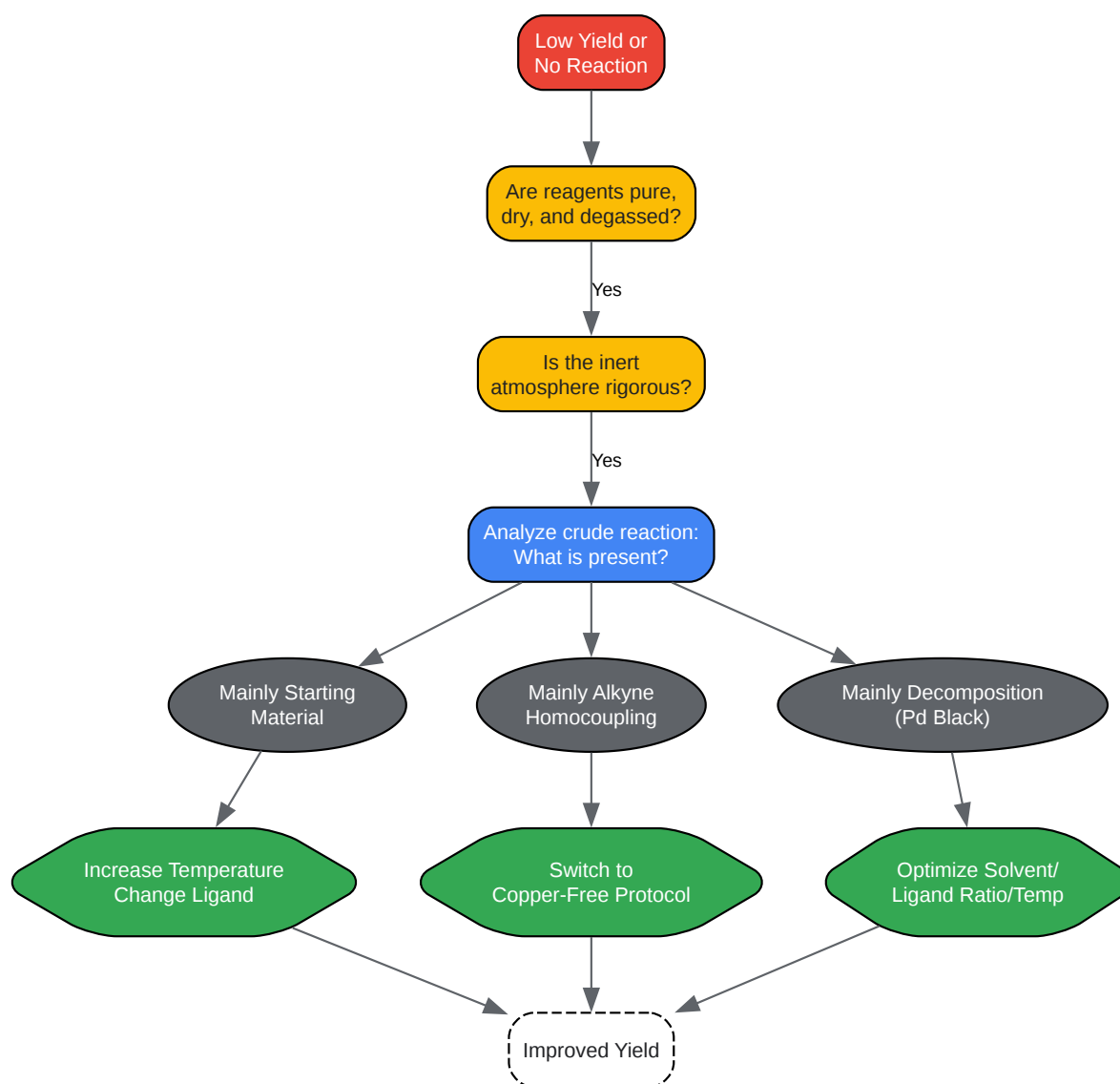
Fig. 2: Troubleshooting Workflow for Low Yields