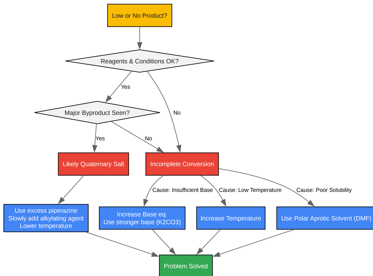
Figure 3: Troubleshooting Decision Tree

Click to download full resolution via product page