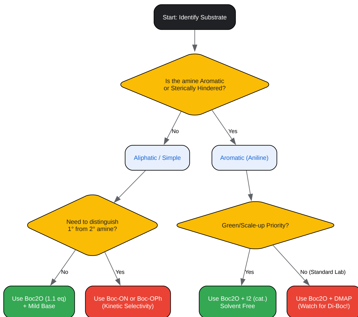
Figure 2: Reagent Selection Workflow

Click to download full resolution via product page