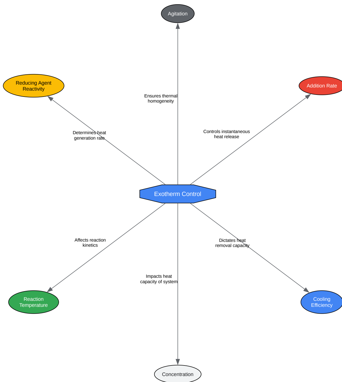
Diagram 2: Key Parameters Influencing Exotherm Control