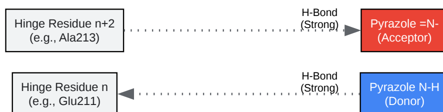
Figure 1: Canonical bidentate binding mode of pyrazole scaffold to kinase hinge.

Click to download full resolution via product page