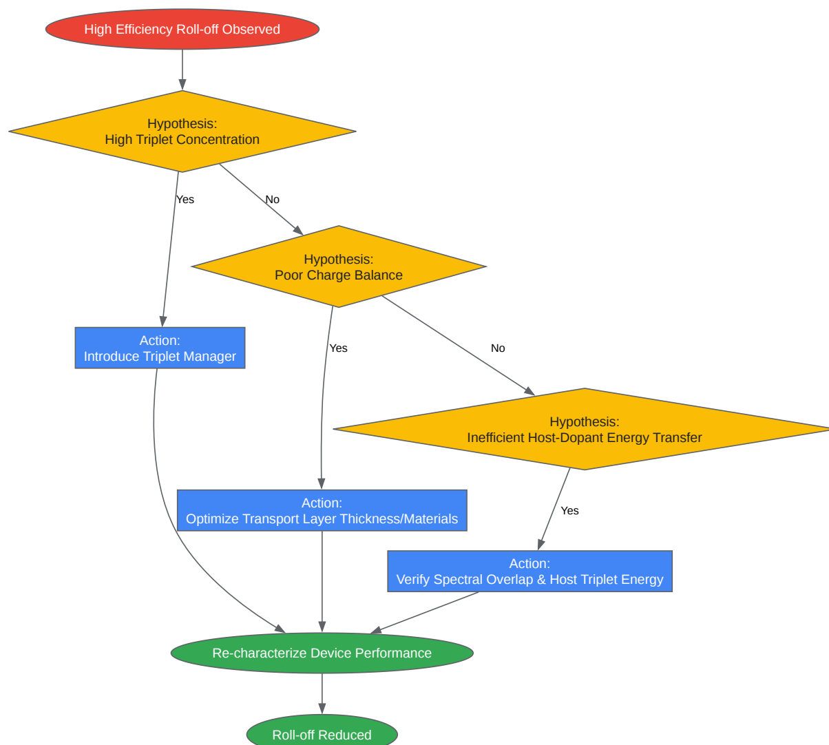
Troubleshooting Workflow for Efficiency Roll-off

Click to download full resolution via product page