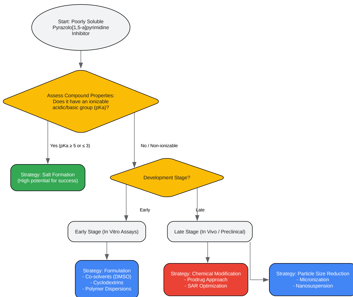
Figure 1: Decision workflow for selecting a solubility enhancement strategy.

Click to download full resolution via product page