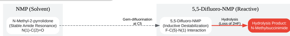
Figure 1: Structural comparison showing the hydrolytic instability of the 5,5-difluoro isomer.

Click to download full resolution via product page