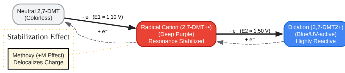
Figure 1: Stepwise oxidation pathway showing the resonance stabilization of the radical cation by methoxy auxochromes.

Click to download full resolution via product page