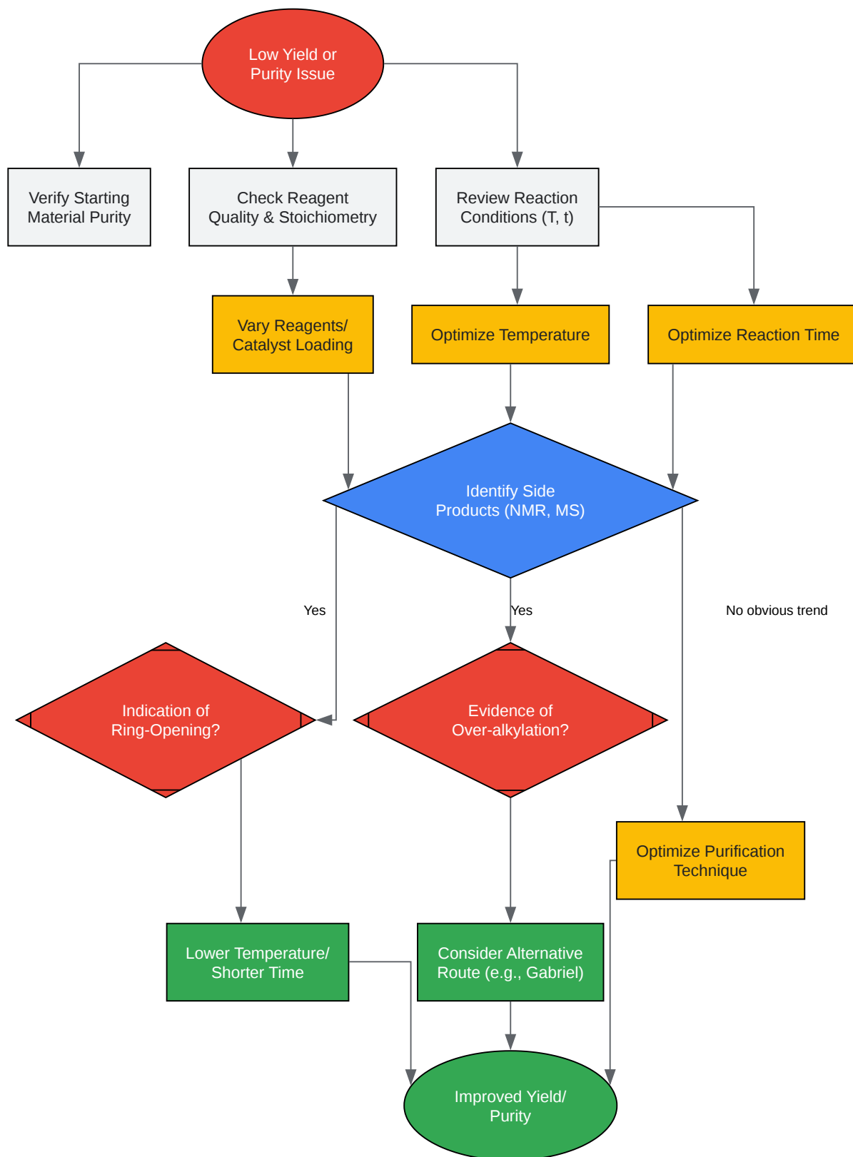
Caption: Synthetic pathways to 3,3-bis(aminomethyl)oxetane.

Click to download full resolution via product page