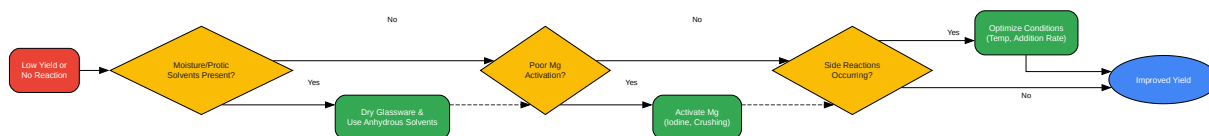
Diagram 1: Troubleshooting Low Yield in Grignard Synthesis

Click to download full resolution via product page