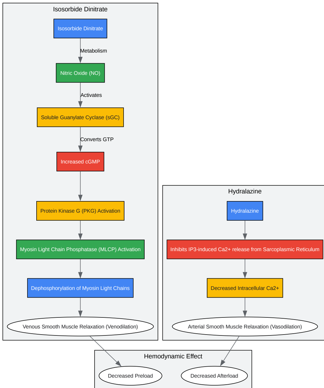
Signaling Pathway of Isosorbide Dinitrate and Hydralazine